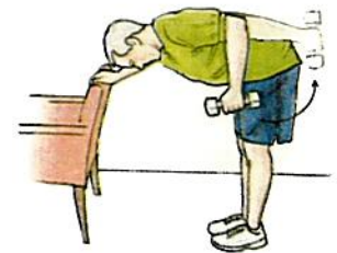
TRICEPS KICK BACK

6. TRICEPS KICK BACK: Lean forward with the hand of one arm resting on a table or chair for support. Hold a weight in the hand of your other arm. Keep the elbow of that arm against your side. Your arm should be bent at a 90-degree angle with your upper arm parallel to the floor. Move the forearm of your arm backward until it is straight. Repeat 10 to 20 times.