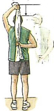
TRICEPS TOWEL STRETCH

2. TRICEPS TOWEL STRETCH: Stand with one arm over your head holding the end of a towel. Put your other arm behind your back and grab the towel. Stretch your top arm behind your head by pulling the towel down toward the floor with hand of your bottom arm. Keep the elbow of your top arm as close to your ear as possible. Hold for 15 to 20 seconds. Repeat 3 to 6 times.