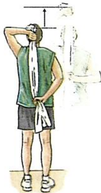
TOWEL RESISTANCE EXERCISE

3. TOWEL RESISTANCE EXERCISE: Stand with one arm over your head holding the end of a towel. Put your other arm behind your back and grab the towel. Lift the top hand toward the ceiling while creating resistance by pulling down on the towel with your other hand. Keep the elbow of your top arm as close to your ear as possible. Hold for 10 seconds. Repeat 10 times.