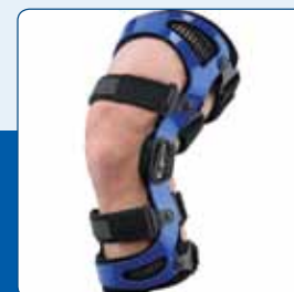
FUSION: Brace for Activities of Daily Living