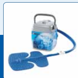
KODIAK: Cold Therapy Unit with Pad