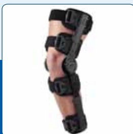
T-SCOPE: Post-op Range of Motion Brace

Here are three common DME products for knee injuries: